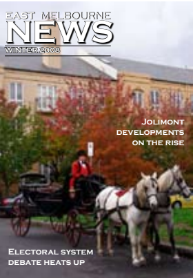
Cabbies grab a hot coffee in Simpson Street

Front cover: A horse drawn carriage waits to collect a wedding party in Wellington Crescent East Melbourne.