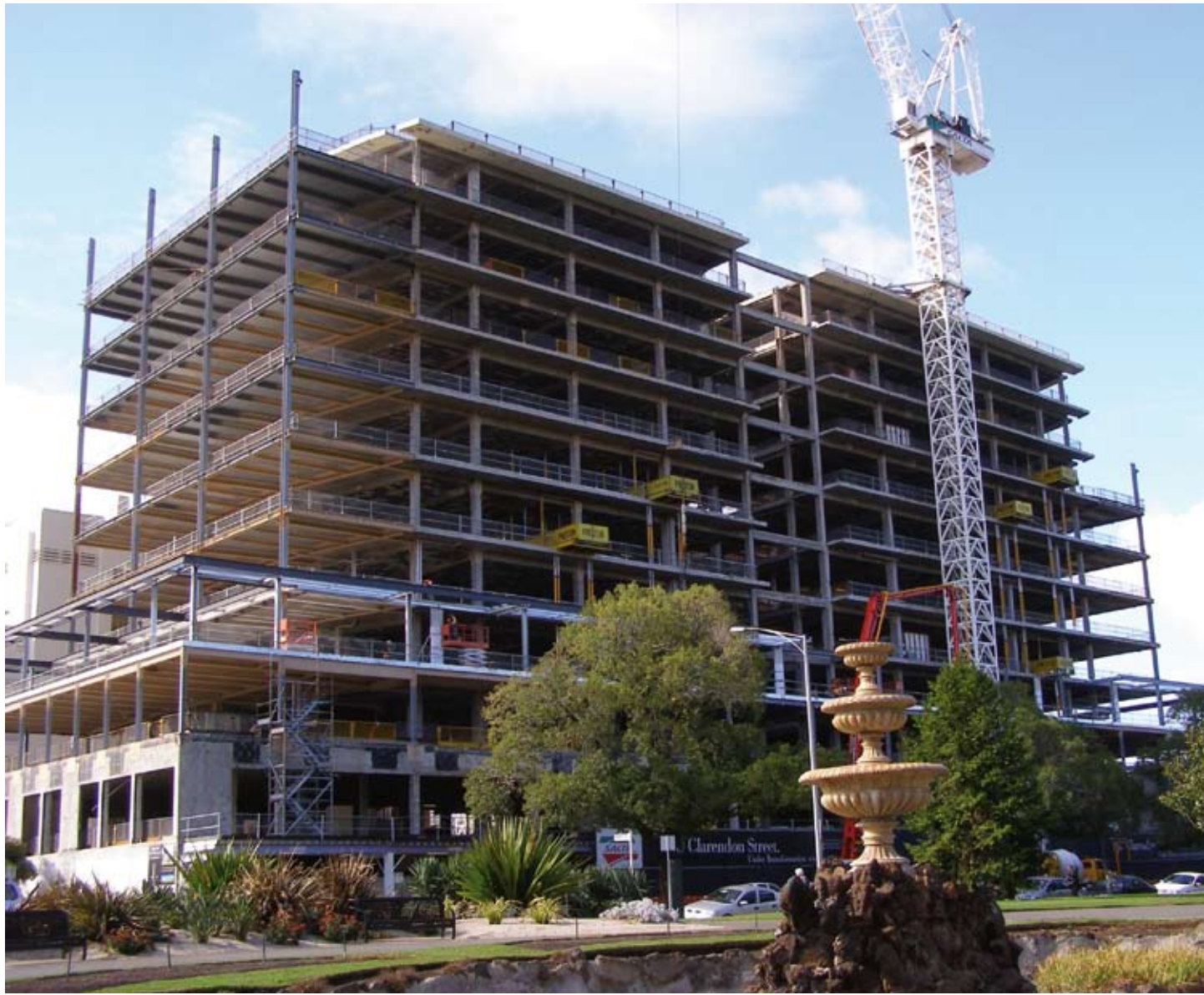
Above: The old Mercy Hospital has lost its bowed shape as work continues on the conversion into residential apartments. The completion of the development at '150 Clarendon' is expected in mid 2009.