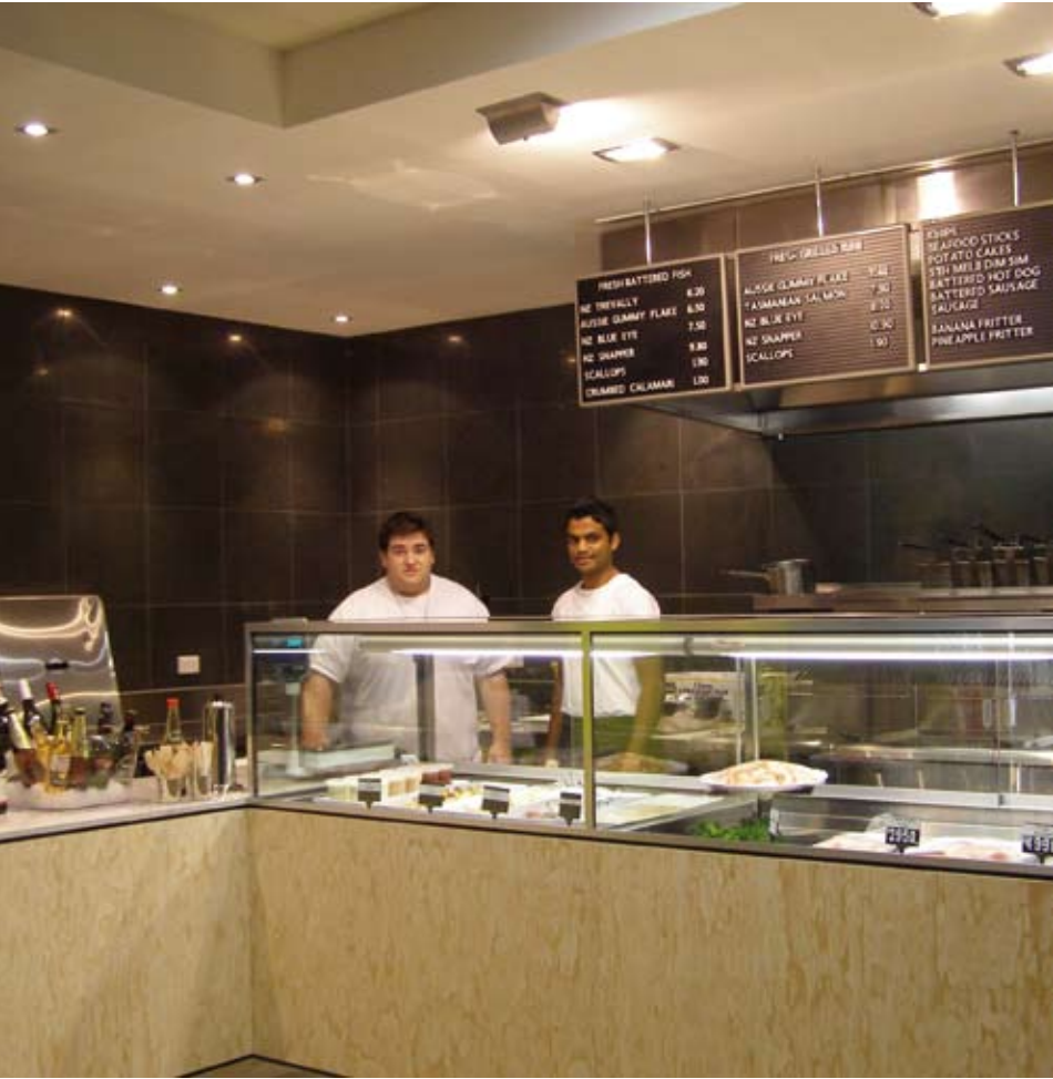
Kiwi Fish and Chips

Be Gossip is located in the shop once occupied by Pyman's Pharmacy, two along from the corner 7-11 Store. Be, the owner of the business, will make you feel welcome when you book for a full body massage or perhaps a relaxing foot massage. Other services include nail spa and waxing. To make an appointment at Be Gossip, ring 9419 6678 or just call in at 138 Wellington Parade from 11am, on any day of the week.