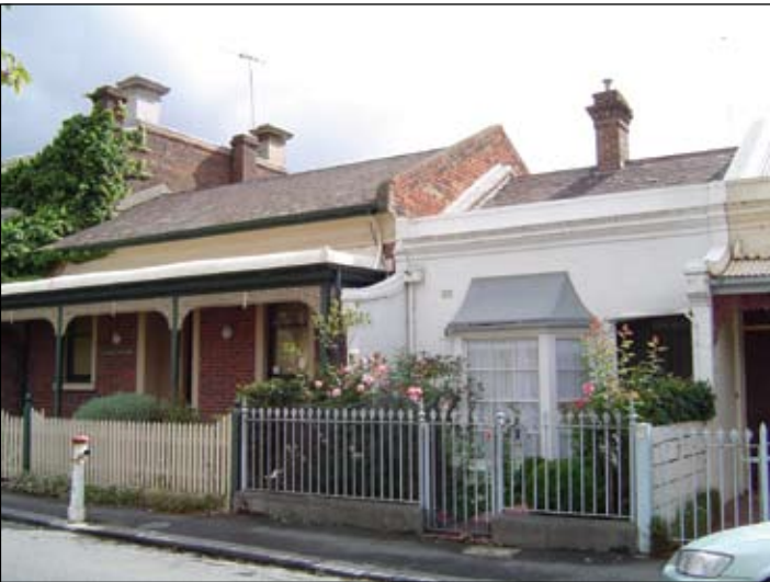
Above, some of the low rise cottages in Agnes Street.