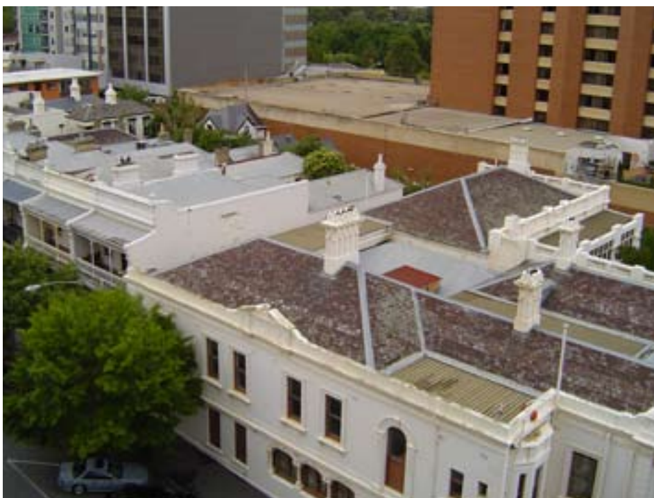
View of Mosspennock and other heritage buildings in George St.

On 31 October 2008, the Court of Appeal upheld the appeal, and declared the Minister's approval of Melbourne Planning Scheme Amendment C101 invalid.