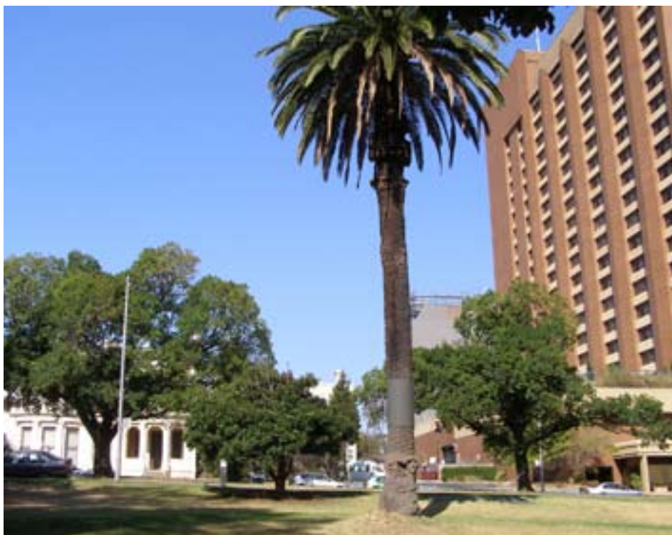
View of Mosspennock and the Hilton Hotel from the Fitzroy Gardens

The Court of Appeal held that the decision was so unreasonable as to constitute an error of law.