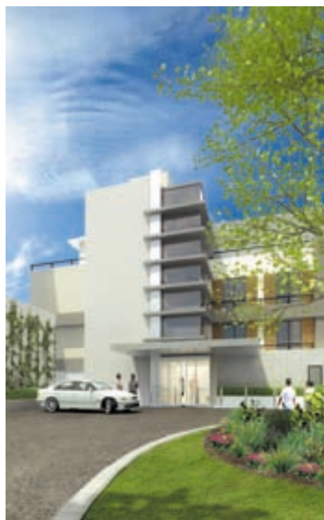
Above: Artist's impression of Mercy Place East Melbourne

Opening in mid-2009, Mercy Place East Melbourne is a new service providing residential care in an elegant environment for older members of the community.