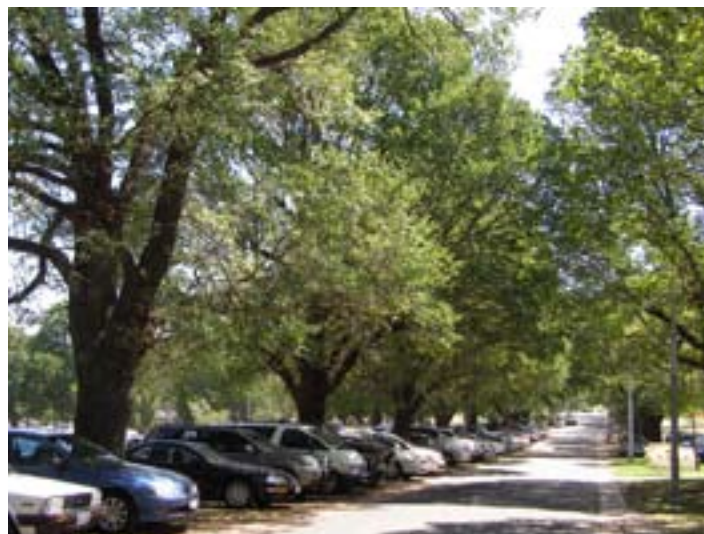
Above: Car parking in Yarra Park

In its recent submission to the VEAC, the East Melbourne Group has detailed its view on car parking in Yarra Park and the destruction it causes. It calls for State Government to either build a car park over the Jolimont railway yards or alternatively, introduce mandatory 'ticket and ride' program to all events.