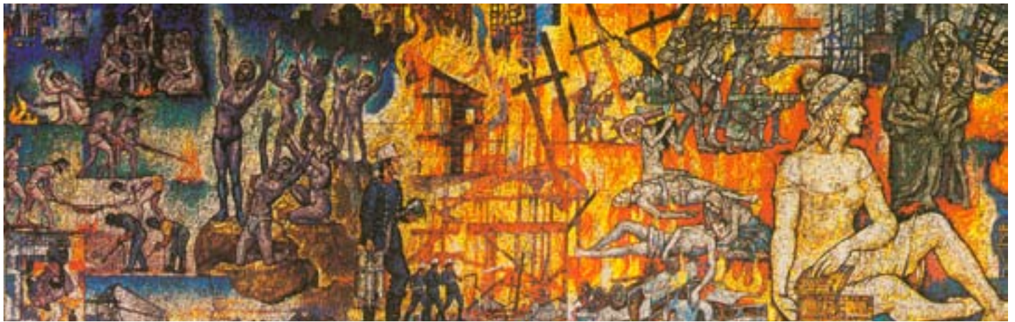
Pictured above: Image of 'Legend of Fire' mosaic on the exterior of the MFB building in Albert Street.