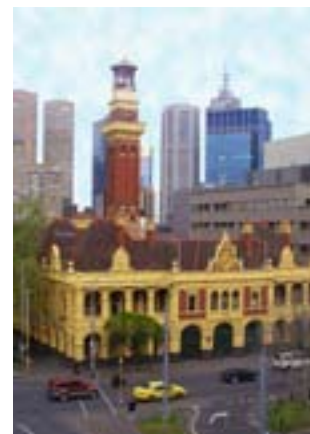
FRONT COVER: Eastern Hill Fire Station East Melbourne Built 1893

The East Melbourne News is supported by the City of Melbourne's Community Grant Program.