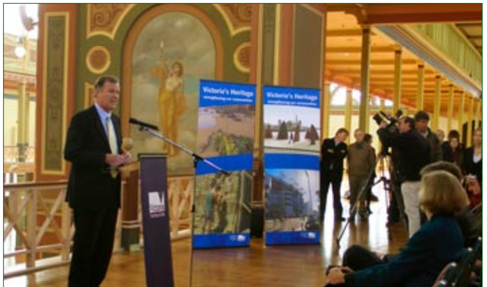
Minister Rob Hulls