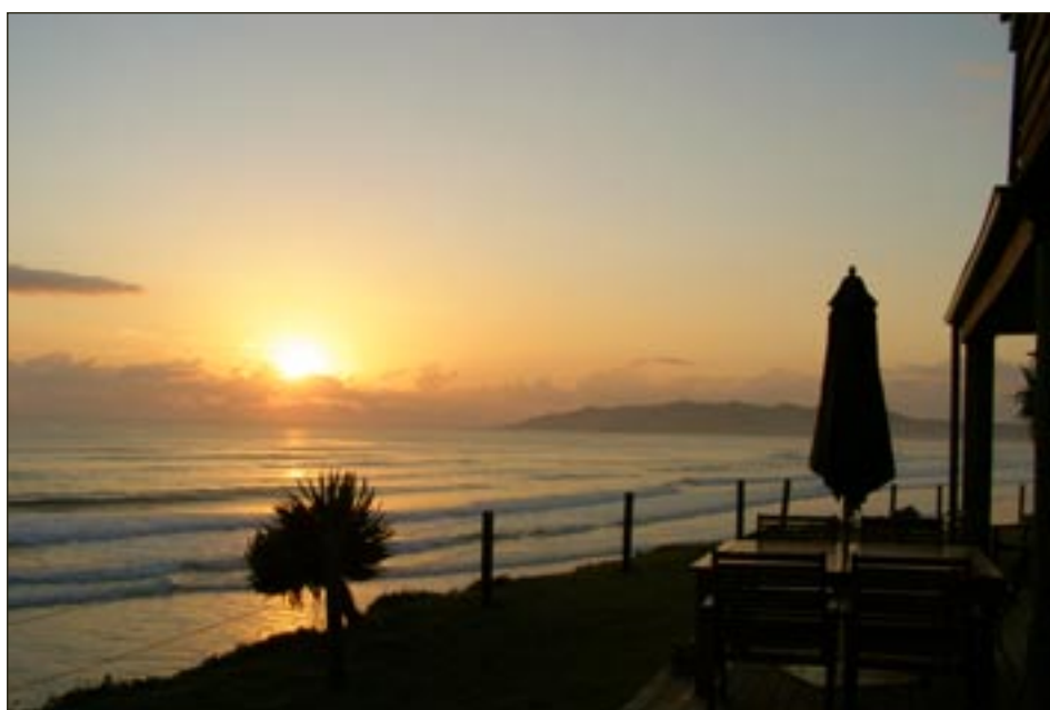
Belongil Beach, Byron Bay

You can contact 'Anna's Place' on 02 6847 2790 or mikelibby@bigpond.com