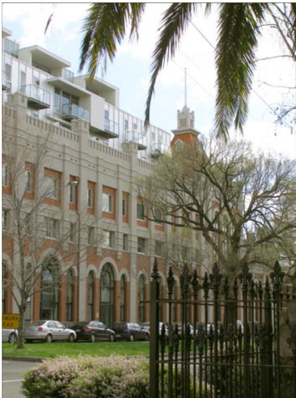
Tribeca building - Powlett Street, East Melbourne

Formally operated as the Carlton and United Brewery, most of the inner nineteenth century buildings were demolished, leaving the heritage protected castellated façade and the brewing towers. From the centre of the site a 14 storey residential tower was constructed to house over 400 apartments.