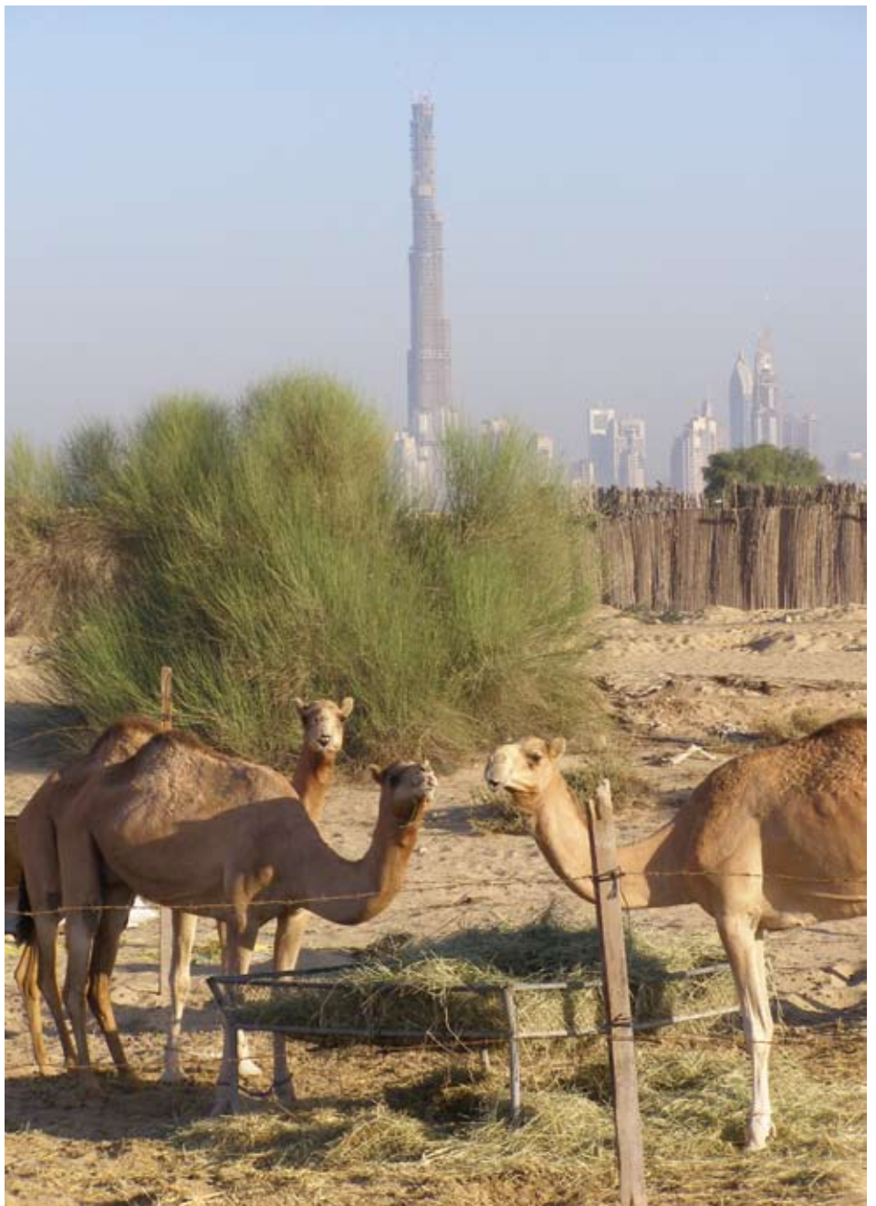
Above: local camels seem oblivious to the new towers looming in the background and the highest building in the world. Below: construction of towers. Left: canals in the dessert.

Off the coast-line is the "Palms Project". It comprises a trilogy of 3 villages of various sizes (Palm Jumeirah, Palm Deira and Palm Jebel Ali), all in the shape of a palm tree. Another piece of reclaimed land is currently being sculptured in the shape of the world (The World Islands).