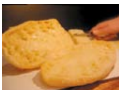
toasted turkish bread with melted kashar cheese

Varieties – Chicken, Ham, Beef, Salami, Tuna, Spicy Chicken, Turkey