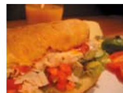
topped off with a tasty sauce