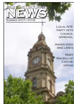
Cover: Melbourne Town Hall Clock Tower