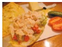
loaded with a variety of fillings