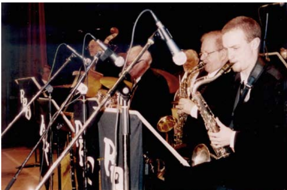
Radio Rhythm Orchestra 16 piece swing band