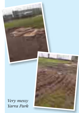
Very messy Yarra Park