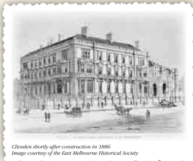
Cliveden shortly after construction in 1886

The building was sold in 1968 and was demolished amid controversy to make way for the high rise Hilton Hotel. The valuable fixtures and fittings were removed and sold at auction. These ran to 2500 lots giving an indication of the sheer scale of what was once such a fabulous building. It is understood that when the Pullman owners carry out the proposed renovations to the lobby area and restaurants, some of the Cliveden artefacts will be incorporated into the new design.