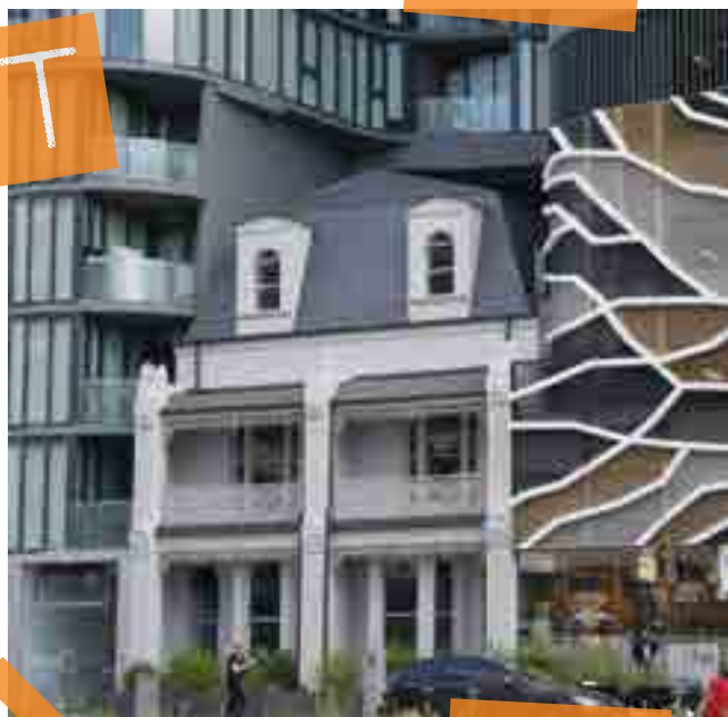
South Melbourne facade

Current local planning policies are a compromise between the two camps, stipulating the amount of heritage fabric to be retained according to the heritage status of the building. However these policies are currently under review and as far as demolition is concerned the degree to which the heritage fabric contributes to the three-dimensional form of the building will soon be relevant. The case is now being put, in anticipation of changes, that demolition is acceptable if it only involves fabric that is concealed from the site's