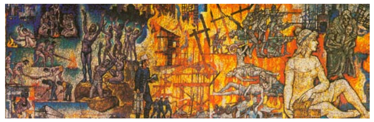
Pictured above: Image of 'Legend of Fire' mosaic on the exterior of the MFB building in Albert Street.