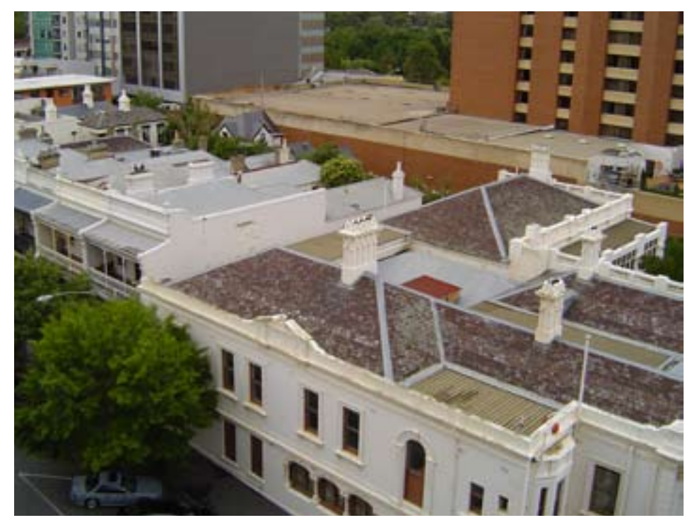
View of Mosspennock and other heritage buildings in George St.

On 31 October 2008, the Court of Appeal upheld the appeal, and declared the Minister's approval of Melbourne Planning Scheme Amendment C101 invalid.