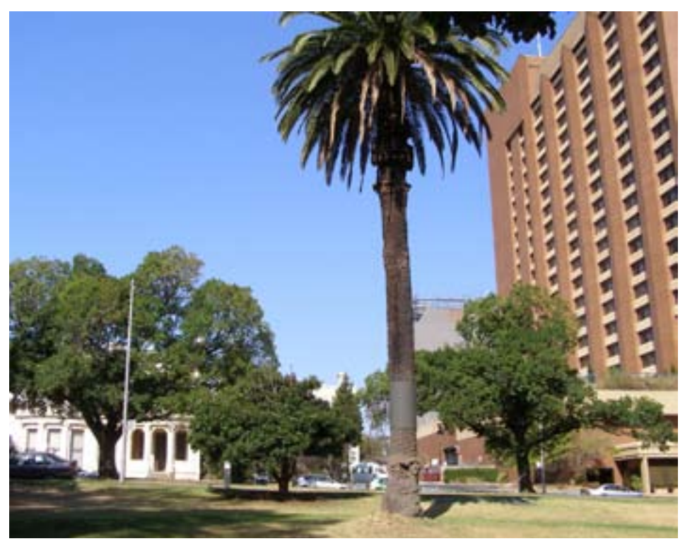
View of Mosspennock and the Hilton Hotel from the Fitzroy Gardens

The Court of Appeal held that the decision was so unreasonable as to constitute an error of law.