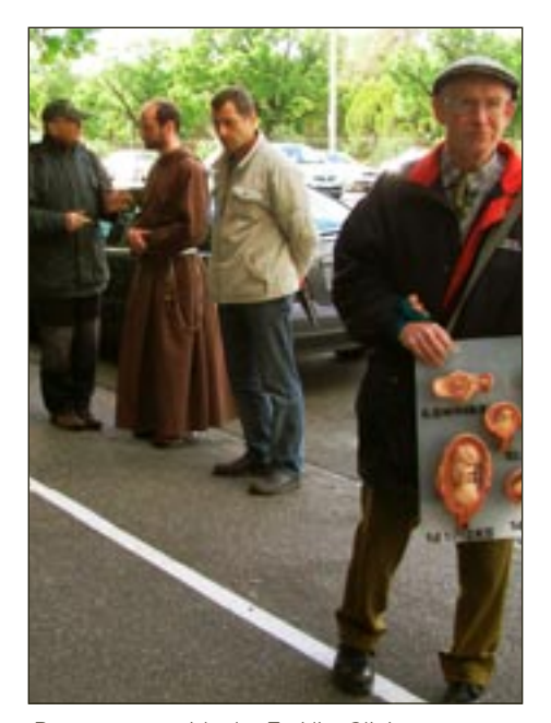
Protestors outside the Feritlity Clinic

The East Melbourne Group, in its submission at the tribunal claimed the proposed billboard had visual impact on nearby Yarra Park as well as heritage buildings nearby. Besides having zero benefit to the public realm, it must not be overlooked that Wellington Parade, once predominantly a business strip, now has a high proportion of residential apartments, many of which look directly on the signage.