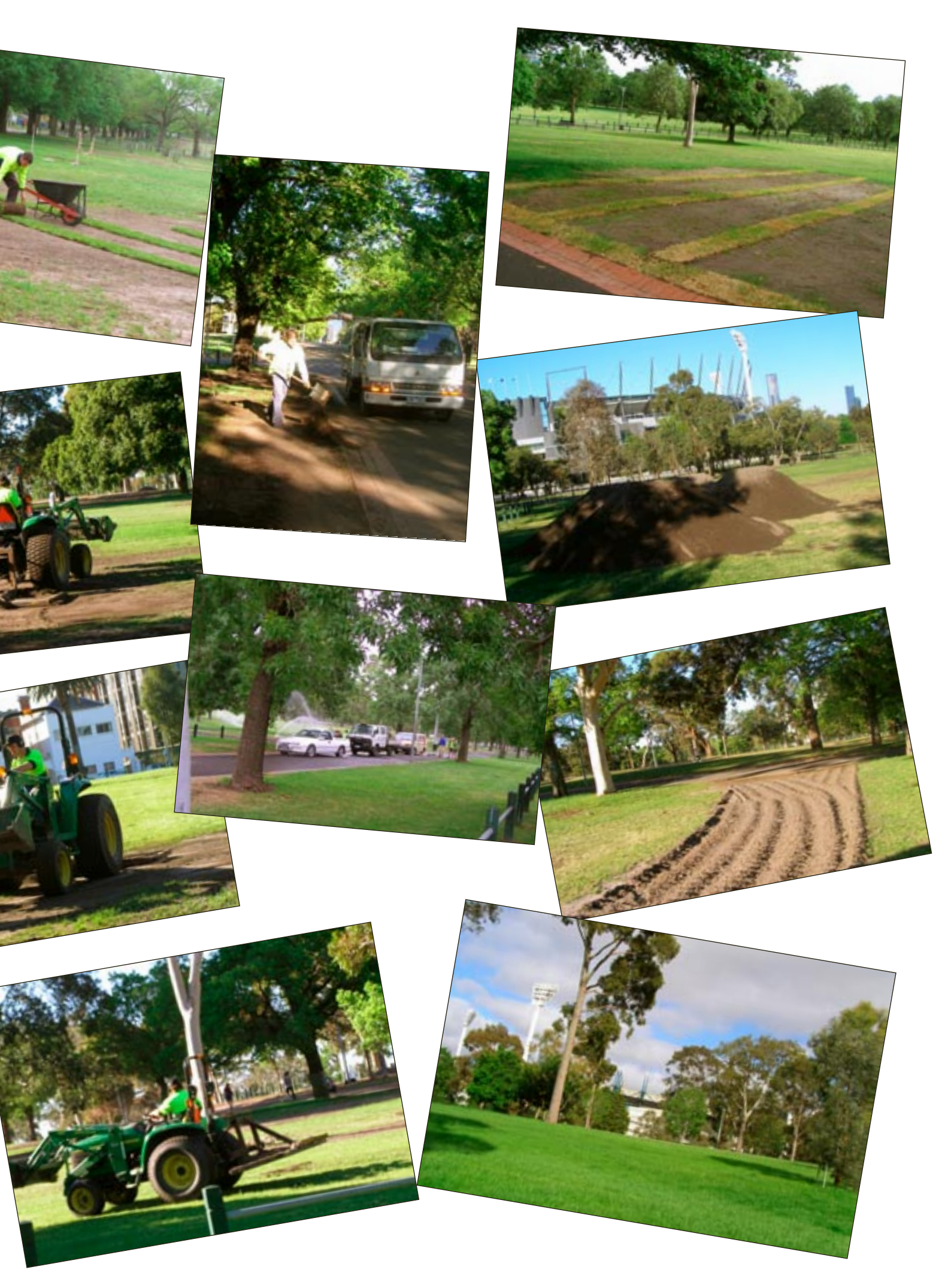
\mathcal{EMG} – Summer 2006/07 – Page 9