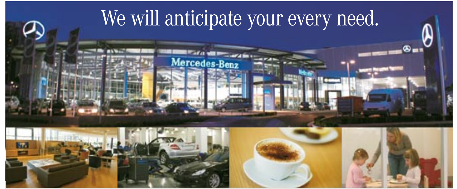
We have everything you would expect from a dealership that's as big as a city block – Like ample parking, coffee shop, creche and the full range of Mercedes-Benz vehicles ready to test drive without an appointment, yet for a large dealership the service is so friendly, attentive and personalised.

Epworth Eastern has recently opened a new $85 million, 223-bed acute-care medical and surgical hospital in Box Hill.