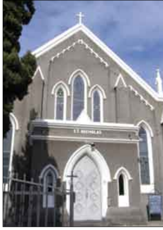
The church in Victoria Parade

St Nicholas has provided a religious and community centre for many first, second and third wave immigrants from Lebanon, other Middle-eastern and Eastern European countries.