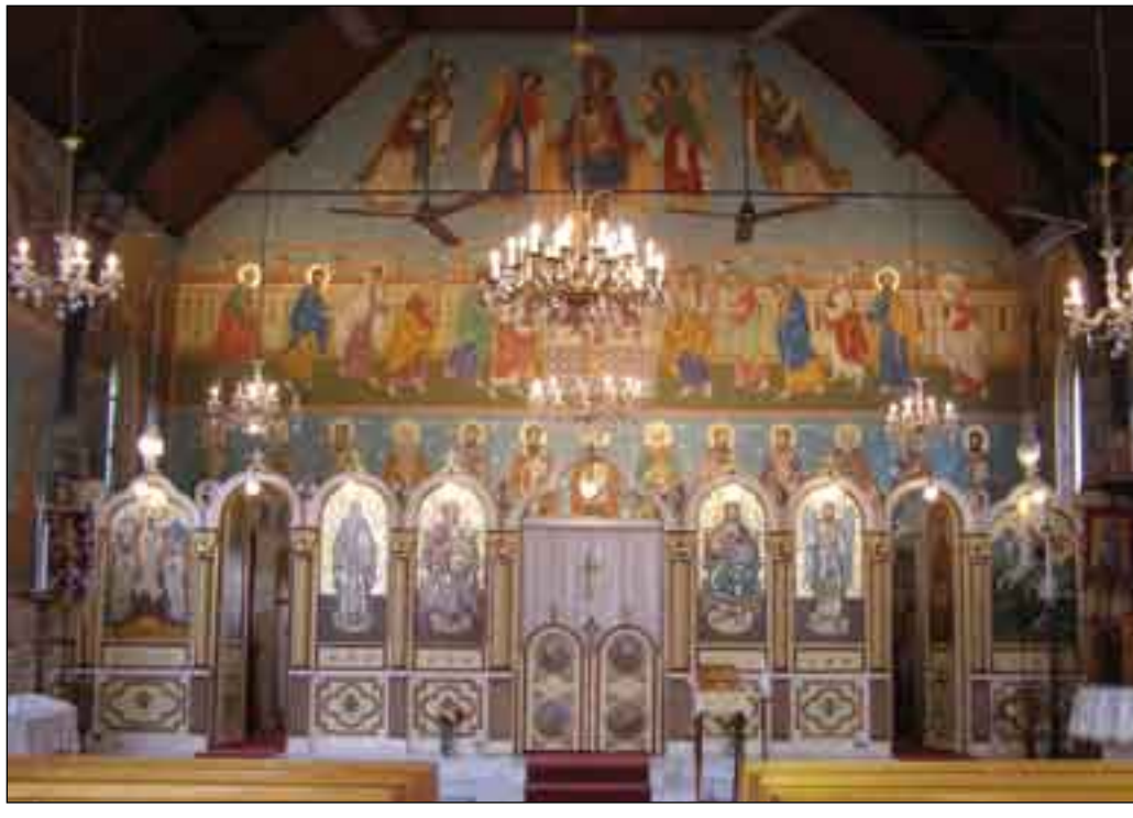
Interior of St Nicholas

The consecration of St Nicholas in East Melbourne in 1932 was a pan-orthodox celebration with the Divine Liturgy being chanted