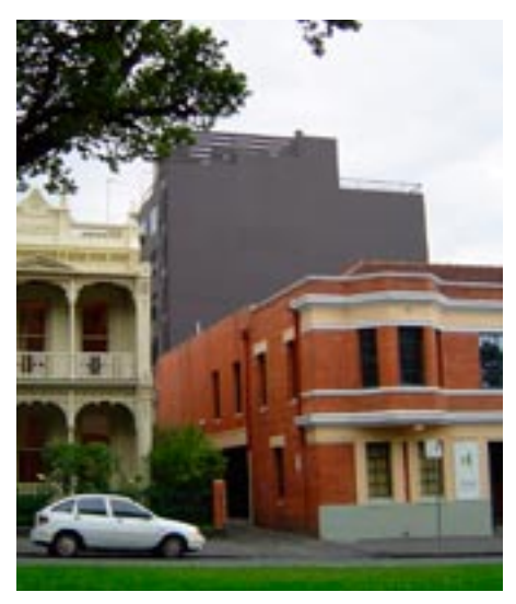
'Signage threat for blank wall'.

City of Melbourne and the East Melbourne Group appeared as parties opposed to the proposal. The EMG argued that the signage of this size was