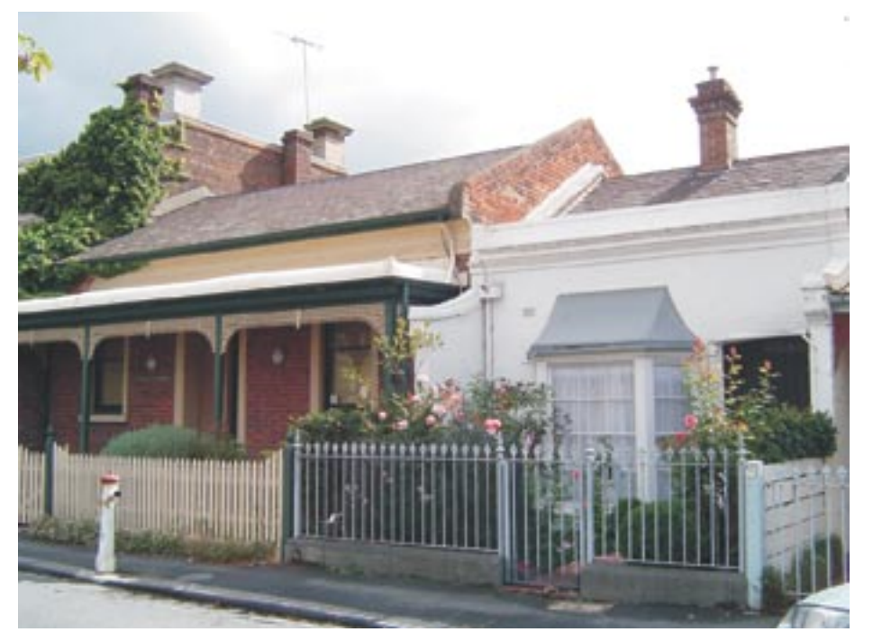
Heritage Cottages in Jolimont.

Ground; Jolimont Square (which predates St Vincent's Place as a residential square); 12 and 32 Jolimont Terrace; and the former Grand Rank Cabman's Shelter. While valuable heritage stock has been lost, 65 per cent of Jolimont is heritage listed even after including the business strips of Jolimont Street and Jolimont Road.